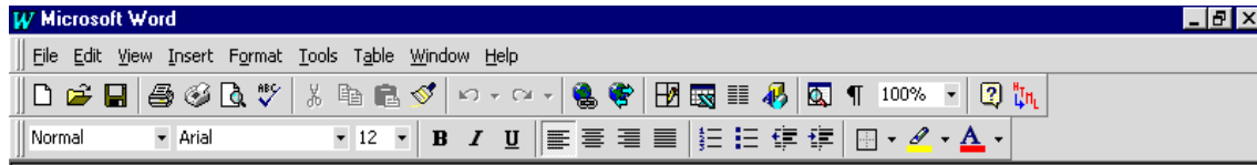
Figure 1 The old toolbar in previous versions of Word

Starting in Office 2007, the standard toolbars were replaced by a ribbon interface. The ribbon interface has the advantage of showing more options depending on what you are working on. Many veteran users of Office did not initially like the ribbon interface because it involves more mouse pointing and less keyboard commands, which tends to slow down your work.