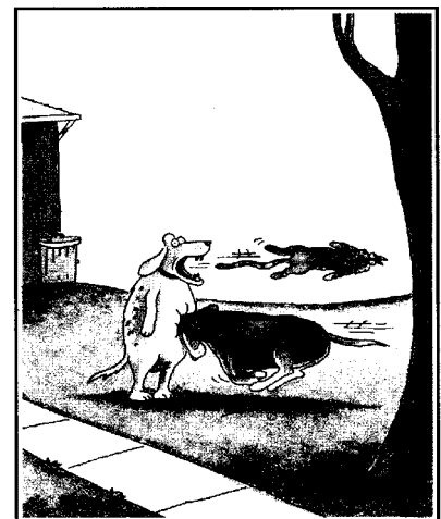
Fortunately for Sparky, Zeke knew the famous "Rex maneuver."